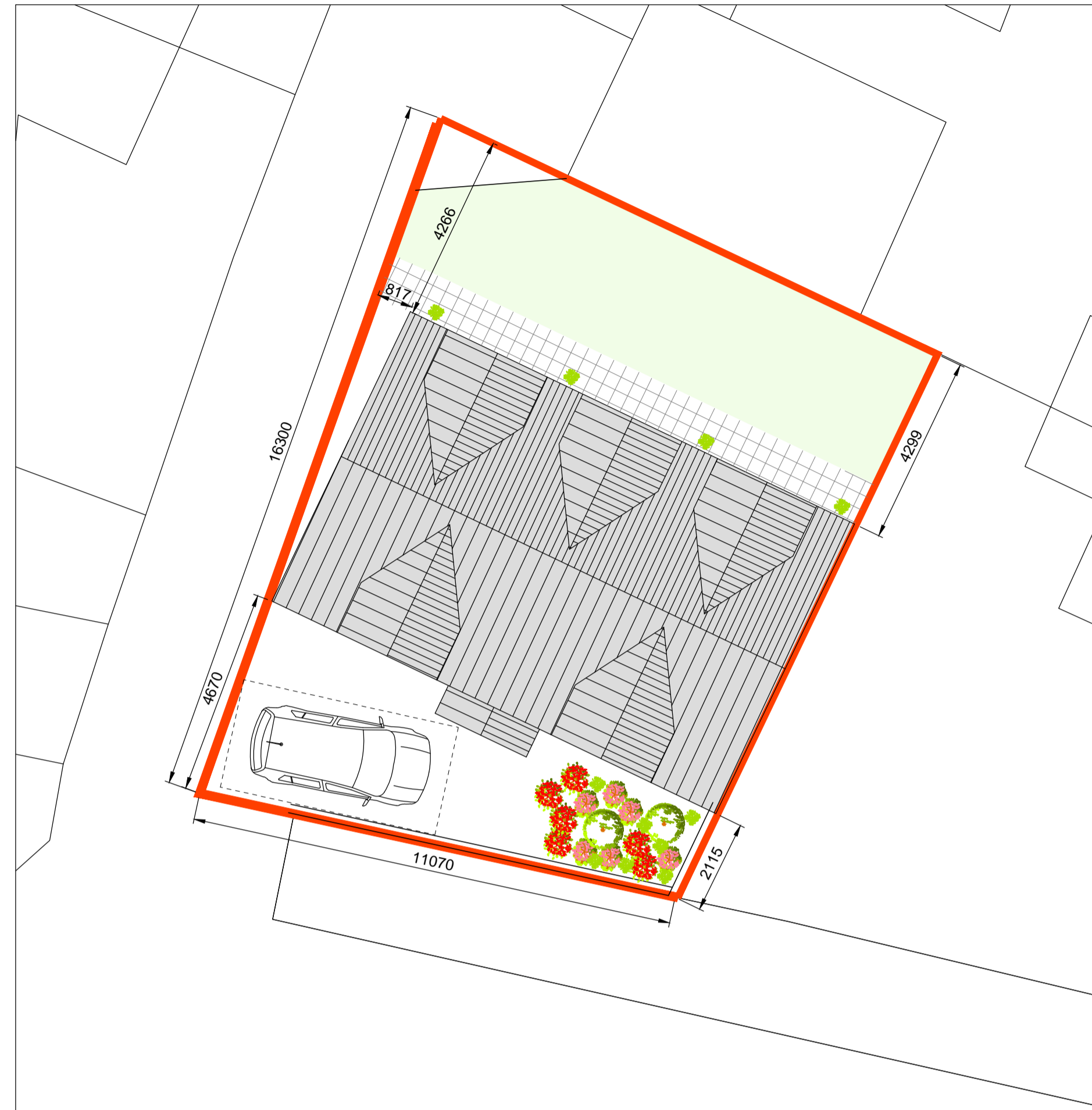
PROPOSED SITE PLAN SCALE 1:100